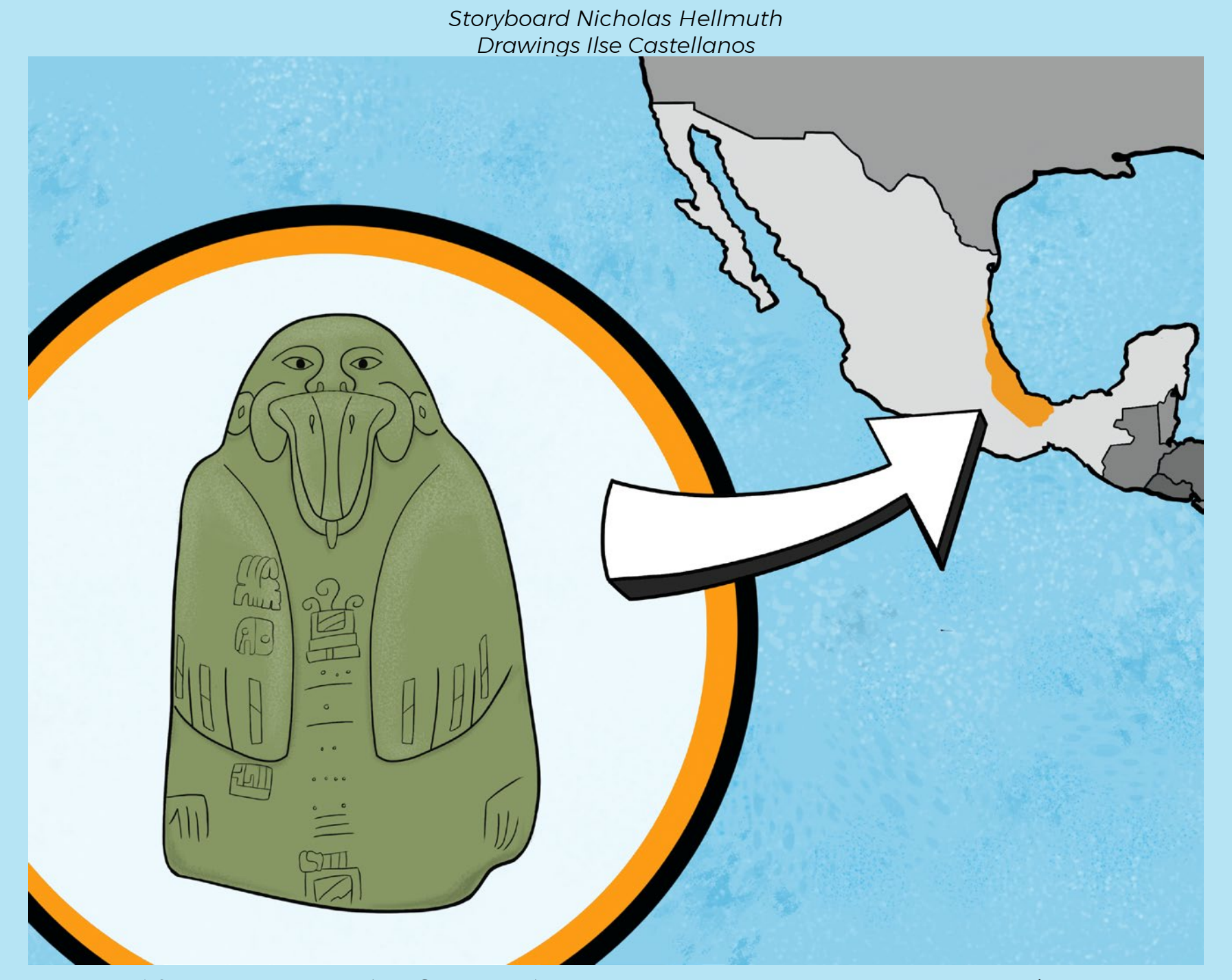
Many years ago, the Olmecs chose to portray me as a God-like symbol. I am oh so proud!